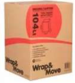
Heavy duty standard size box at Bunnings