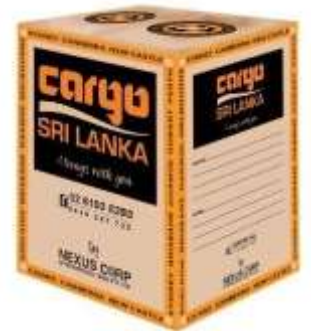
Nexus standard size box