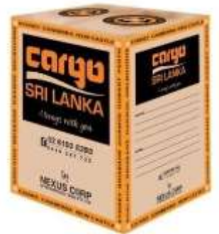
Nexus standard size box